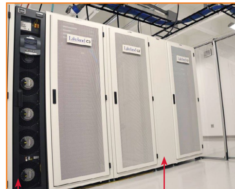
In-row cooling unit

The long term goal at Lakeland was to implement containment throughout the data center while using a combination of traditional CRAC units and several in-row cooling units. Three rows of enclosures were arranged in a hot aisle/cold aisle configuration; two rows of six ES enclosures and one row of nine EN enclosures. Each row of ES enclosures included space for up to three in-row cooling units. A total of three in-row units were installed within the two rows of ES enclosures; however, three additional 12" gaps were left between enclosures to allow future units to be installed. In order to preserve proper cooling in the hot aisle/cold aisle layout, Great Lakes manufactured in-row place holders to fill the gaps. When increased cooling capacity is required, the panels can easily be removed to make room for additional in-row units.